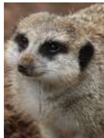
Giraffe and Meerkat